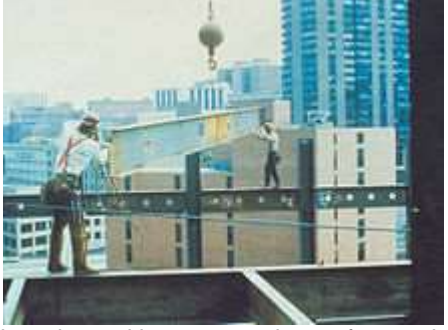
At-risk workers without appropriate safety equipment

Physical hazards are a common source of injuries in many industries. They are perhaps unavoidable in certain industries, such as construction and mining, but over time people have developed safety methods and procedures to manage the risks of physical danger in the workplace. Employment of children may pose special problems. Falls are a common cause of occupational injuries and fatalities, especially in construction, extraction, transportation, healthcare, and building cleaning and maintenance.